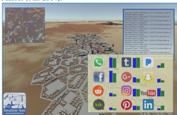
Figure 2 – Communications and Diffusion on web

Hall 2001; Bonabeau 2002; Sokolowski & Banks 2011; Massei et al. 2014).