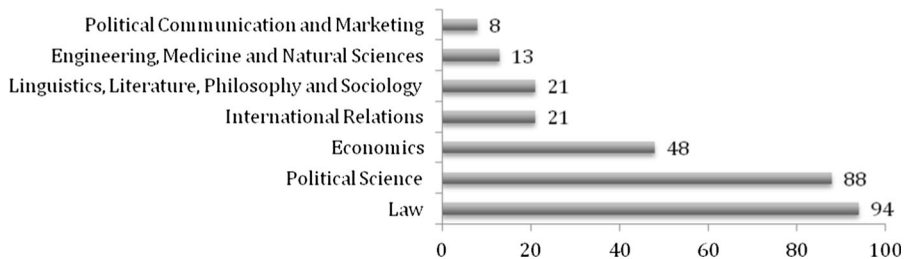
Fig. 2 Number of students according to their Academic Background academic background in law (94) and political science (88) (see Fig. 2), and around half of them were between 20 and 22 years old.

The next section assesses the above-mentioned arguments, while conclusions illustrate the main findings of the empirical analysis.