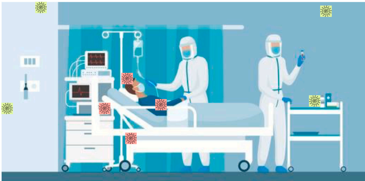
Fig. 2. Schematic diagram showing environmental sampling sites in the inpatient area of the hospital. The presence of the virus is indicated in red and the absence in green. Contaminated areas are those close air (<1 m) at patients at 1.5 m of height for 1 h. (For interpretation of the references to colour in this figure legend, the reader is referred to the Web version of this article.)

longer times. In addition, the membrane sampler is much louder than the bubbler sampling. This element is of particular importance in the choice of the sampling method in the wards where it is necessary to cause the least possible disturbance to patients and healthcare workers.