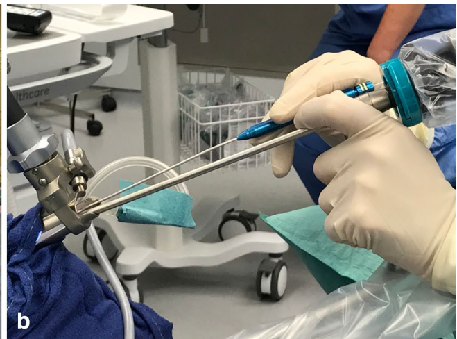
Fig. 4 CO 2 Transoral flexible laser surgery or CO 2 TOFLS. a With microscope. b With rigid telescope

only (with a handpiece) would be defined as CO 2 TOLS (Fig. 2). KTP transnasal flexible laser surgery would be KTP TNFLS (Fig. 3). Transoral use of the flexible CO 2 wave-guide with a handpiece would be a CO 2 TOFLS (Fig. 4a, b). In the case of CO 2 TOLFS, what is important to consider is the fact that the CO 2 fiber is used transorally that can be under microscope or rigid telescope visualisation.