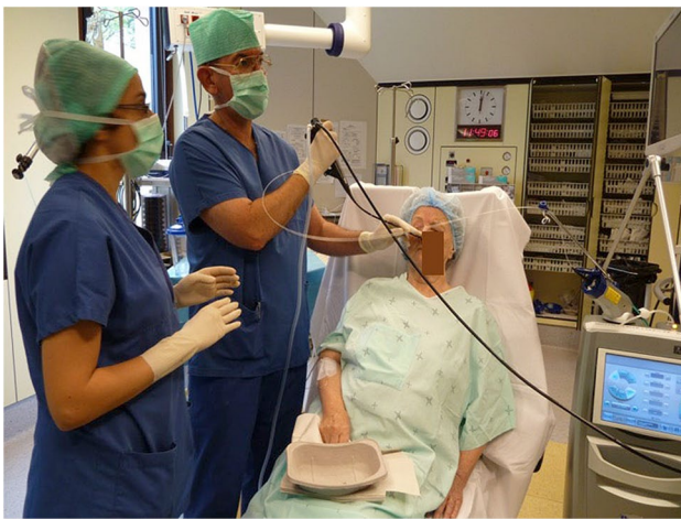
Fig. 3 CO 2 Transnasal flexible laser surgery or CO 2 TNFLS