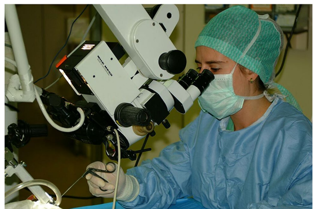
Fig. 1 CO 2 Transoral laser microsurgery or CO 2 TOLMS

In this manner, what is usually called TLM, would more clearly be defined as CO 2 laser transoral microsurgery or CO 2 TOLMS (Fig. 1) or CO 2 laser transoral surgery