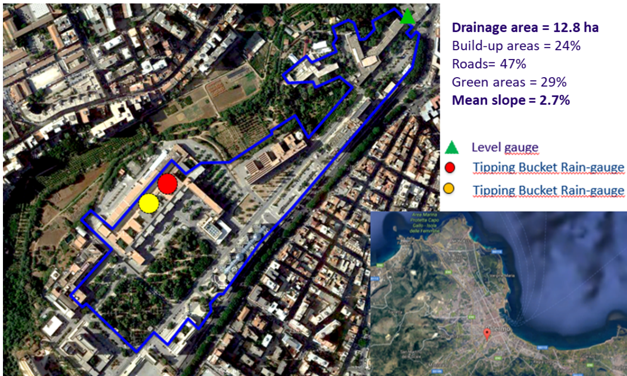
Figure 1. The Parco d’Orleans case study.

Contemporary high temporal resolution rainfall and runoff data series are available between 1993 to 1998, and are used for the calibration of the hydraulic model in terms of roughness of the urban surfaces. The total drainage area is 12.8 ha with 68% of impervious areas; the drainage network is composed of circular and egg-shaped concrete conduits. In the present work, the sensitivity of this rapid response system to the accuracy of the rainfall input is studied, with reference to drainage failures and urban flooding issues. In order to quantify the instrumental mechanical error of the two available Tipping Bucket Rain-gauges, these were calibrated at the rain gauge laboratory of the WMO Lead Centre on Precipitation Intensity “B. Castelli” following the procedure described in the recent EN 17277:2019 standard on precipitation measurements.