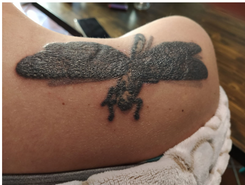
FIGURE 1 | Fifteen year-old tattoo made of black pigment with erythematous and painful infiltrative reaction with papules and plaques.

At the last CT scan reassessment, the patient remained disease-free, and the mediastinal lymph nodes were no longer enlarged ( Figure 3 ). The patient is currently asymptomatic, with no signs of melanoma recurrence or inflammatory relapse as of the time of writing this letter.