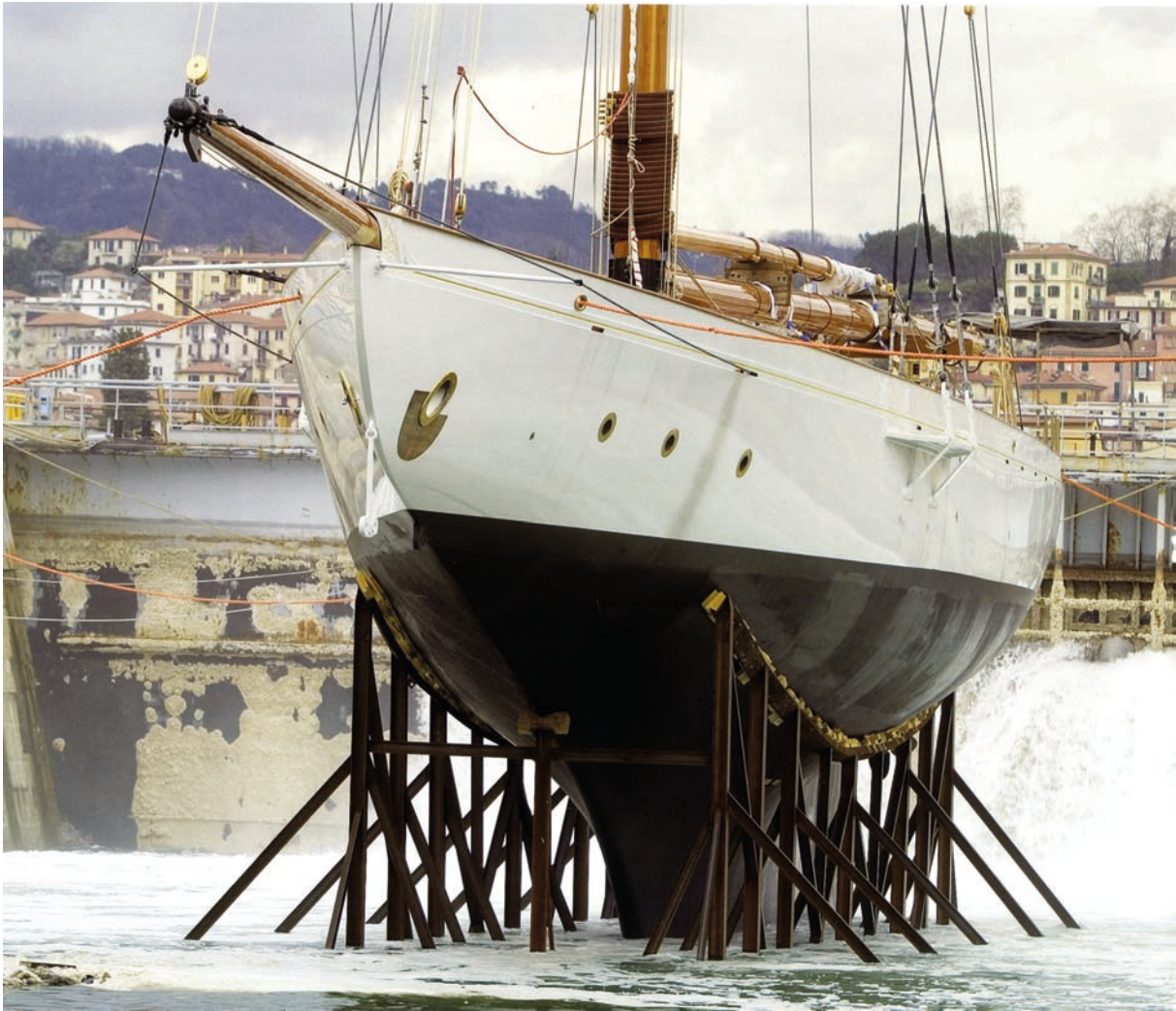
Fig. 3: Launch of the famous vintage yacht Lulworth inside Arsenale Militare di La Spezia, after the recovery ended in 2006 (restoration project by Studio Faggioni Yacht Design).

From a legislative point of view, the last goal was, in November 2017, the modify of D.Lgs n.117-2005. The new Codice della Nautica da Diporto , implemented with D.Lgs. n.229-2017, in clause 3, comma e, introduces the definition of nave da diporto minore storica [historic minor pleasure ship]: any ship of more than length 24 mt, according to UNI/ EN/ISO/8666, of a maximum 120 GT [gross tonnage], built before the first of January 1967. The definition is specifically for the naval sector: the dimensional limit, up to 24 mt, excludes many vessels that we usually consider. Nevertheless, the law has been appreciated by community that glimpses new possibilities and openness unknown before.