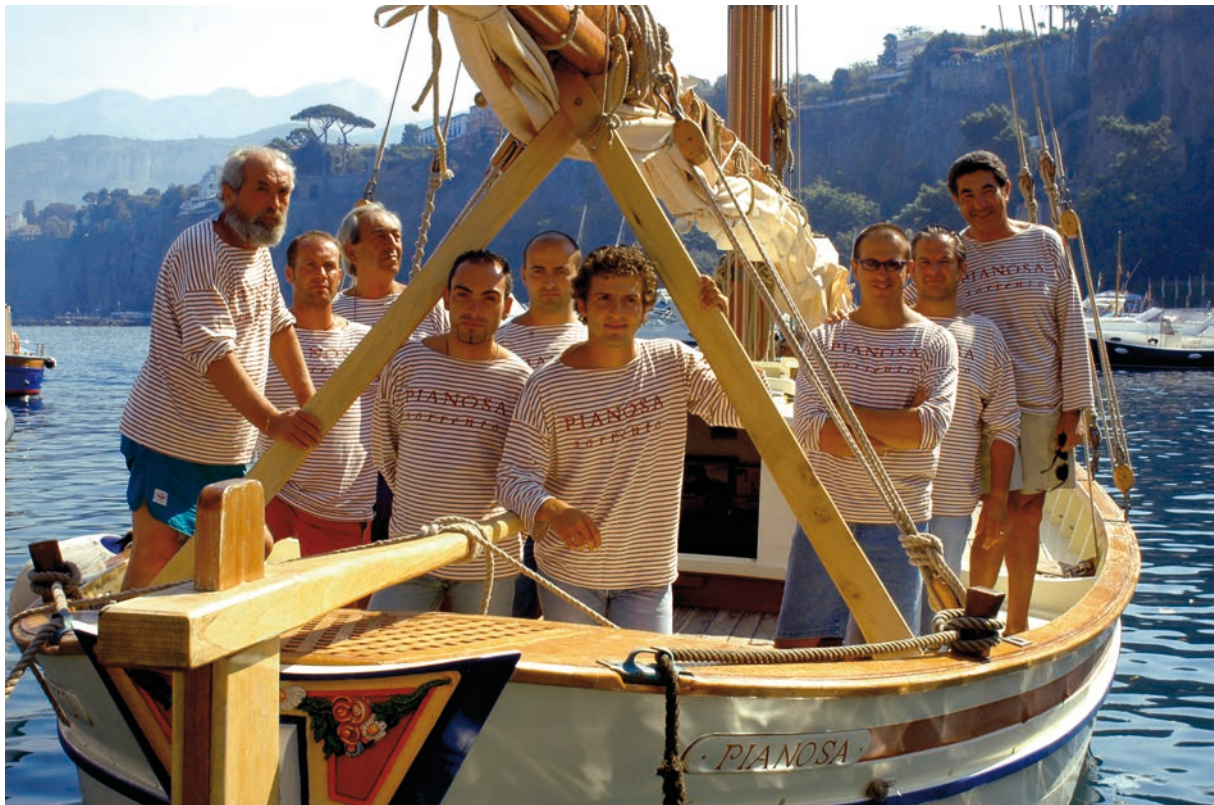
Fig. 2: Gozzo sorrentino Pianosa's crew. In 2003, after the restoration started in 2001, MIBAC declared the boat Italian historical and artistic heritage (restoration project by Studio Faggioni Yacht Design).