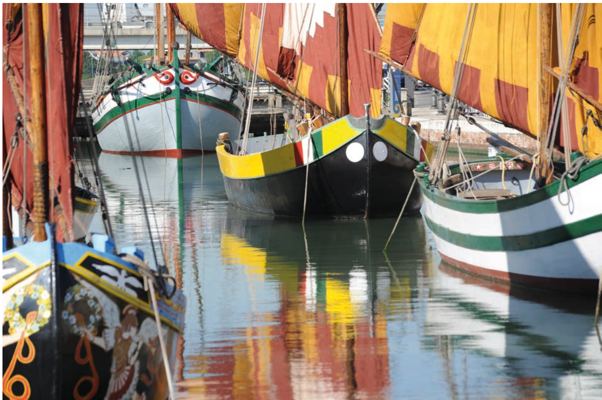
Fig. 1: Floating Section of Museo della Marineria di Cesenatico. Twelve traditional boats from the Upper Adriatic, from Easter festivity to September, every day lift their sails

The unique certainty which surrounds the scenario just described is the Italian law, D.Lgs n.42-2004, better known as Codice dei Beni Culturali e del Paesaggio which is one of the few staples useful for starting any critical thought.