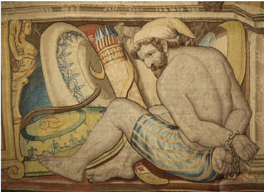
Fig. 11c and 11d. Defeated Turks , detail of Return of the victorious fleet to Corfu , sixth piece of the “ Battle of Lepanto ” set of tapestries, Genoa, Palazzo del Principe, Neptune’s Hall