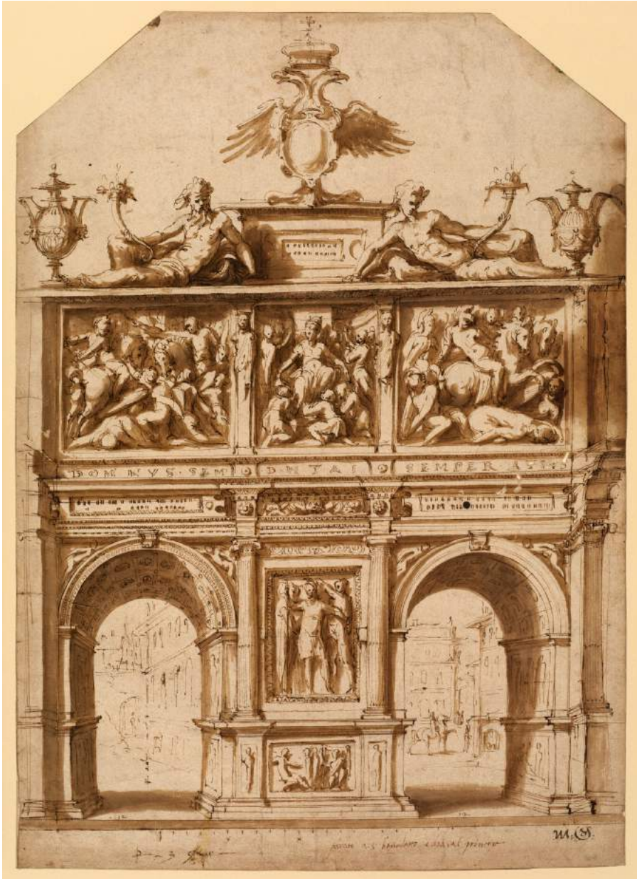
Fig. 1. Perino del Vaga, Triumphal Arch for Charles V's 1533 entry in Genoa , London, Courtauld Institute of Art, Blunt Collection