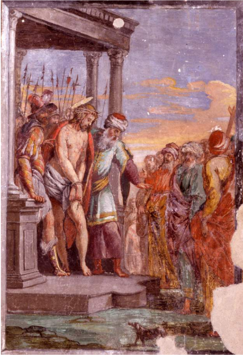
Fig. 8. Cesare and Alessandro Semino, Ecce Homo , Genoa, Palazzo del Principe © Amministrazione Doria Pamphilj srl, Rome