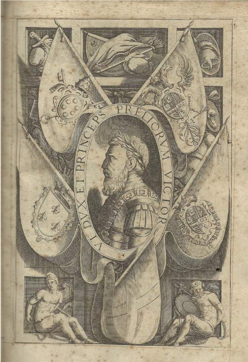
Fig. 3. Portrait of Andrea Doria “VT DVX ET PRINCEPS PRELIORVM VICTOR”, by Enea Vico, in L. Capelloni, Vita del prencipe Andrea Doria discritta da m. Lorenzo Capelloni con un compendio della medesima vita, e con due tauole; l'una delle cose più generali, & l'altra delle cose più notabili , Venezia, Gabriele Giolito De Ferrari, 1565