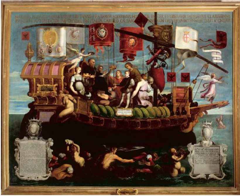
Fig. 9. Late 16 th century painter, The Passage of Power from Andrea to Giovanni Andrea Doria (Andrea Doria's triumph), Genoa, Palazzo del Principe