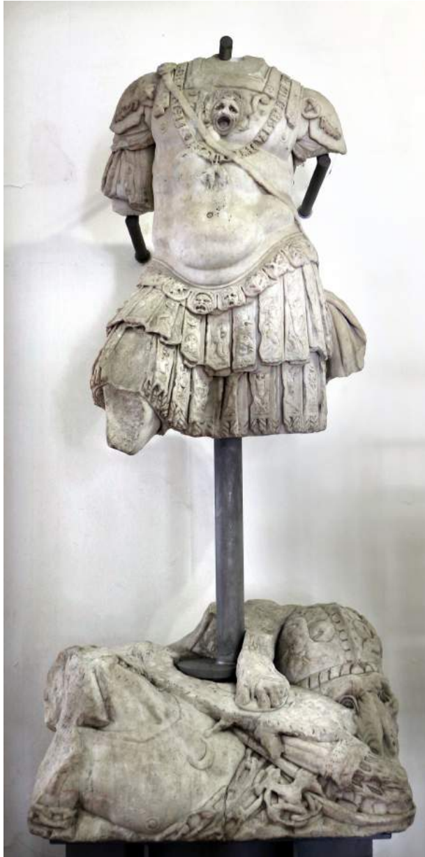
Fig. 5. Giovannangelo Montorsoli, All'antica portrait statue of Andrea Doria (fragments) , Genoa, Palazzo Ducale