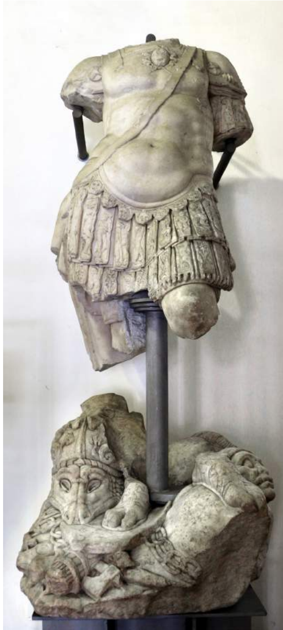
Fig. 14. Taddeo Carlone, All'antica portrait statue of Giovanni Andrea Doria (fragments) , Genoa, Palazzo Ducale