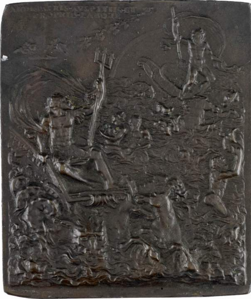
Fig. 6. Leone Leoni, Giannettino Doria's marine triumph, with Andrea Doria as Neptune , plaque, London, British Museum