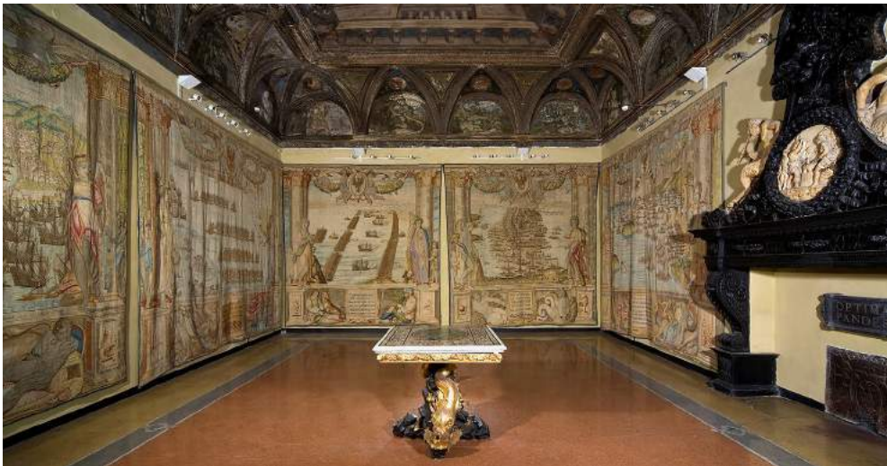
Fig. 10. "Battle of Lepanto" set of tapestries, designed by Luca Cambiaso, Genoa, Palazzo del Principe, Neptune's Hall