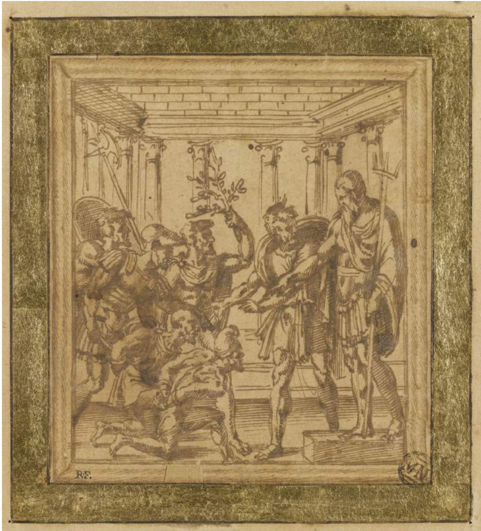
Fig. 4. Baccio Bandinelli, Andrea Doria receiving captives wearing Phrygian caps , Paris, Musée du Louvre, Département des Arts graphiques