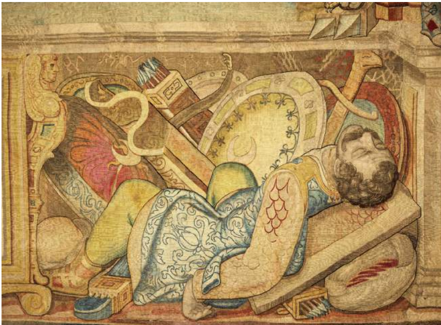
Fig. 11a and 11b. Defeated Turks , detail of The victory and the seven Ottoman galleys' flight , fifth piece of the "Battle of Lepanto" set of tapestries, Genoa, Palazzo del Principe, Neptune's Hall