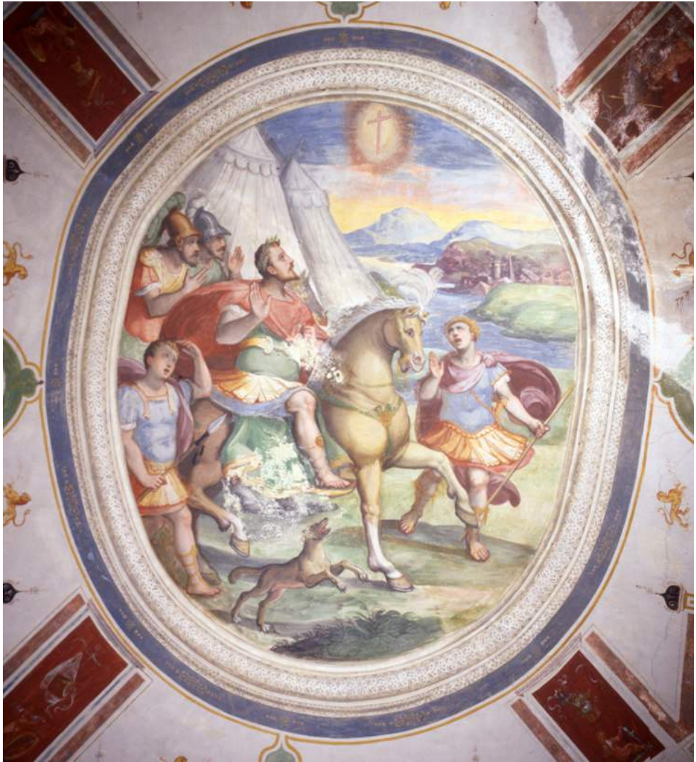
Fig. 12. Lazzaro Calvi, Constantine on the eve of the battle at the Milvian Bridge, Genoa, Palazzo del Principe, Constantine's Hall