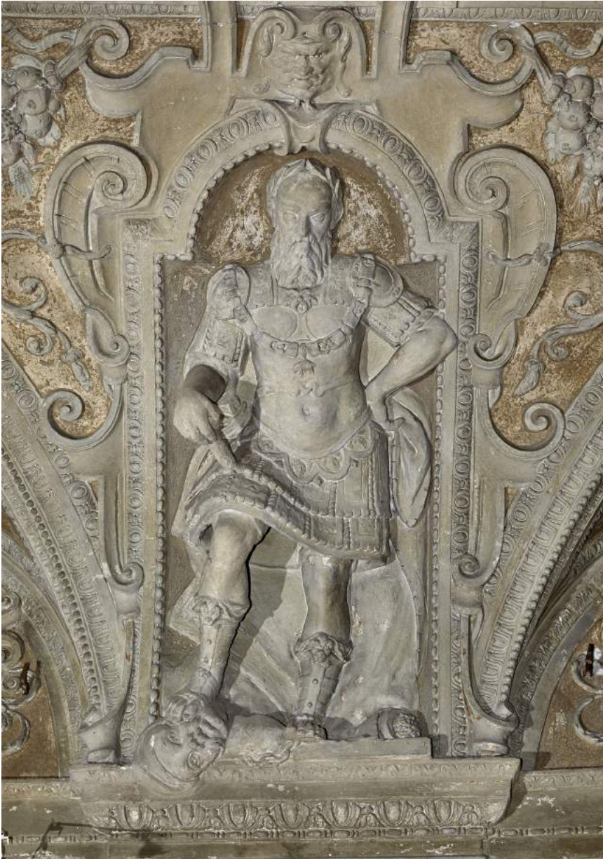
Fig. 13. Marcello Sparzo, All'antica portrait statue of Andrea Doria , Genoa, Palazzo del Principe, Golden Gallery