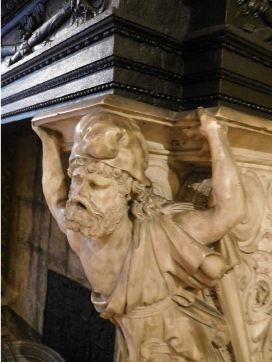
Fig. 2. Figure of slave , part of the Hall of the Giants' monumental fireplace, Genoa, Palazzo del Principe