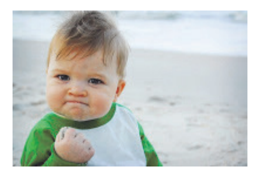
Figure 11. Meme associated with ma vieni and ma andiamo.

to synonymic elements. This can be regarded as a paradigmatic analogical process which, following Barðdal (2008: 89), is conceived as «based on lowest possible type frequency, i.e. one, and highest degree of semantic coherence, i.e. full synonymy between the source and the target item».