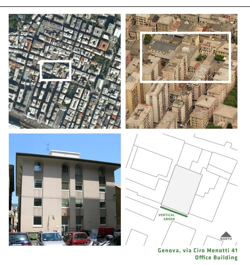
Figure 1. INPS office building location in a dense urban area in Genoa, Italy.