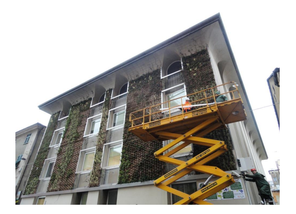
Figure 2. The green facade during construction.