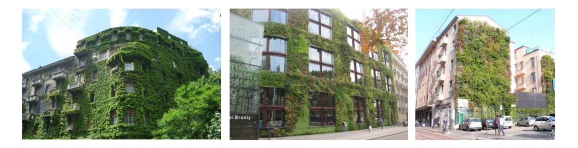
Figure S1. Some examples of green facades

Have you ever seen one or more? □yes □no Have you ever heard about it? □yes □no