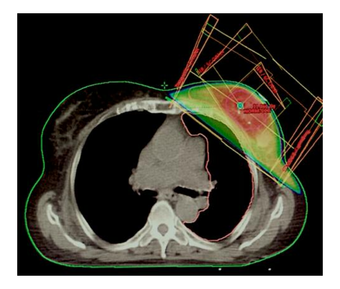
Figure 1. Example of simultaneous integrated boost dose distribution in irradiation of the left breast.

patient after three fractions at the patient's request, against physicians' advice.