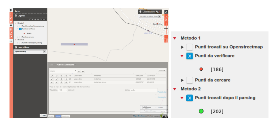
Fig. 3. Our user interface with an example of ambiguity.

first geotagging step with OSM. We provide two examples to better illustrate the method: