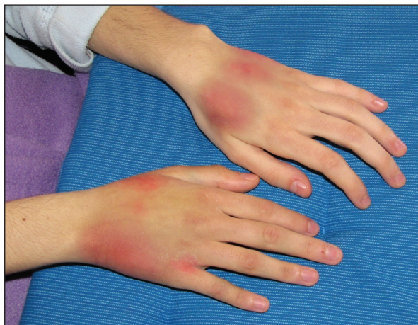
Figure 1: Bruising lesion localized to the hands with edema and dysesthesia

At first glance, the patient appeared to be seemingly well adjusted. On careful probing, an emotional vulnerability