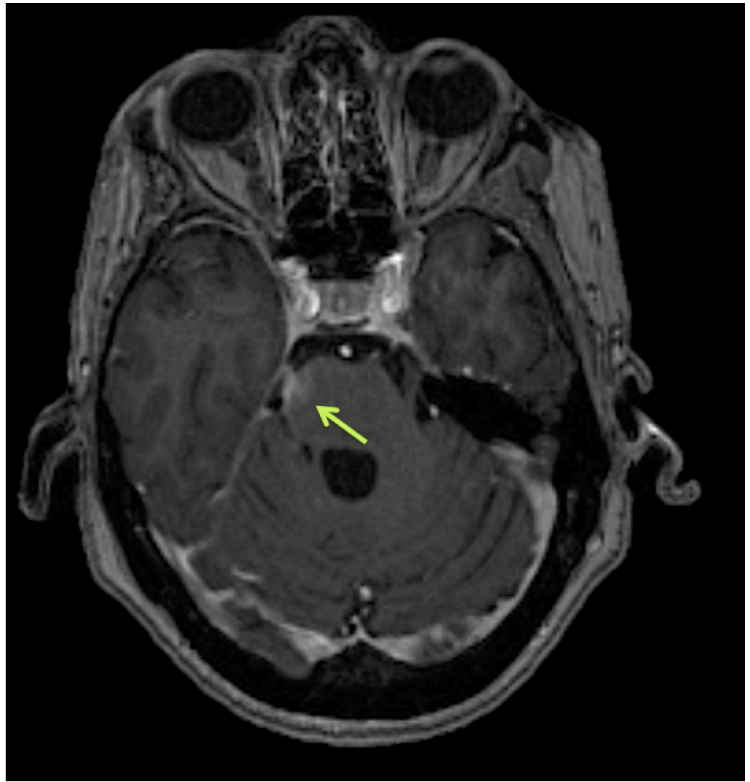
FIGURE 1: Brain MRI

Post-Gadolinium axial T1-weighted image showing a right paramedian pontine area of contrast enhancement, at the level of the emergence of the fifth cranial nerve (green arrow).