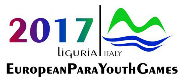
Fig. 2 Logo of the European Para-Youth Games, 9–15 October 2017, Liguria, Italy

Competitions in as many as eleven sports will be organized, subdivided into basic sports (athletics, swimming, table tennis, boccia), other Paralympic sports (football 5-