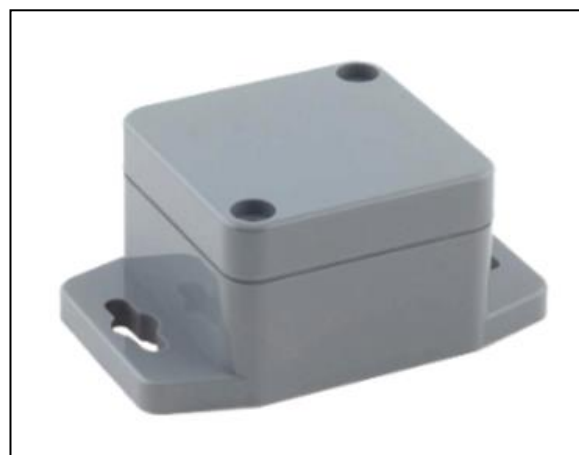
Fig. 2. Anchor

The reference anchors (beacons) are installed in a variable number (usually 2-4) on each machine or within the isolated or confined areas to be monitored so that each device worn by the operators present therein can continuously refer to one of the anchors installed. The anchor is shown in figure 2.