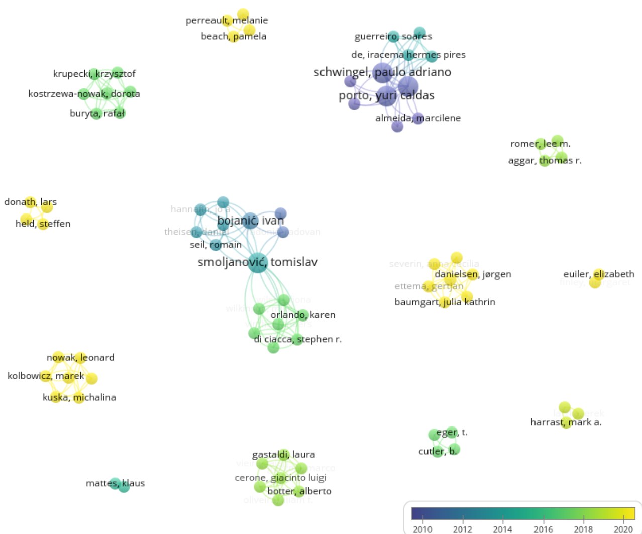
Figure 2. Bibliometric map showing connections of the authors in the field of para-rowing.

The bibliometrics analysis enabled us to identify 78 researchers (nodes), 16 (20.51%) of whom were highly interconnected (Figure 2). The resulting graph (Figure 2) consisted of 202 links (edges), with a total link strength of 209, and 14 clusters. The most prolific author was Smoljanović, T., with 3 items/documents (representing 17.6% of the scientific output overviewed in the present scoping review). The list of the ten most productive scholars can be found in Table 1. In total, 93.6% of scholars have authored one single document. The main topological features of the scholarly community of authors on PR are shown in Tables 5 and 6: these features indicate a highly fragmented and dispersed, poorly connected community characterized by a relatively high number of clusters and a low strength of connections. In terms of publication years, the first scholarly article dates back to 2008, with four articles (23.5%) published in the current year, showing an increasing interest in this para-sports discipline.