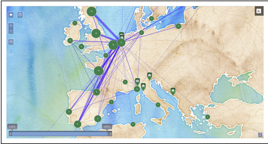
Figure 1. Risky business database interactive map, rotterdam market.