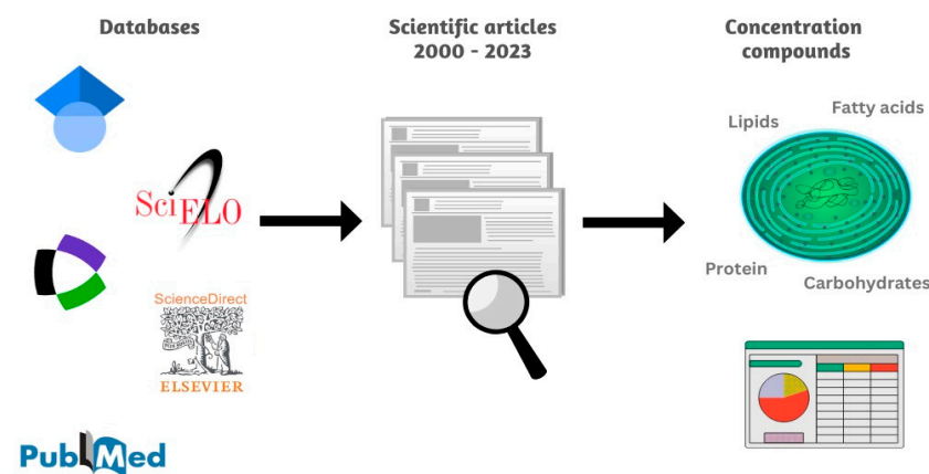
Figure 1. Platforms used in the search for scientific articles for review, date of chosen scientific articles, and primary metabolites revised.

Data selection depends on the purpose of the study and data availability [26]. From this premise, data were selected from published research articles using the Google Scholar, Scielo, PubMed, Science Direct, and Web of Science databases. The main inclusion criteria were the impact factor of journals and the publication of articles in the period from 2000 to 2023. The keywords cyanobacteria, lipids, lipid content, fatty acids, carbohydrates, proteins, and biofuel were used for the search (Figure 1). Review articles with consistent and clear data were considered; however, the concentration values were extracted from the original articles.