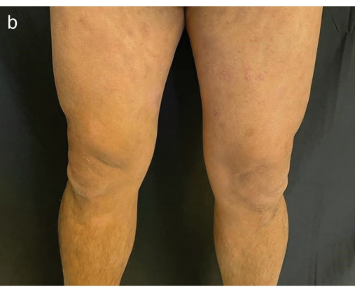
Figure 1 Clinical appearance of the lesions: gray hyperpigmented patches on the trunk (a) and legs (b).