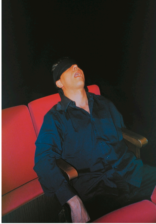
Figure 4. Cesare Viel, Operazione Bufera , 2003, performance, Piccolo Teatro Carambolage, BZ, color photo printing, 124 × 87 cm. Used with permission.

In this way, Viel rejects the alleged truth of live broadcasted news and images. In the setting that the audience has access to, at the Klein Kunst Theater in Bolzano or at the Fondazione Baruchello in Rome, Viel's body, clearly disguised, is a delayed body: it relates to a precise referent—to the image of the Chechen kamikaze—and at the same time it signals its distance from it, while his voice artificially recreates the supposed thoughts of the people who were inside the Dubrovka Theater. He takes inspiration from the newspaper and television news, with the awareness that whatever is reconstructed is definitively lost 23 . Unlike the past performances, the artist does not engage in a dialogue with the protagonists of the hostage-taking—not even with the Chechen militant whom he impersonates—but he reflects on the process of dissemination of images, presenting himself as a simulacrum body. He does not incarnate them, but their media images.