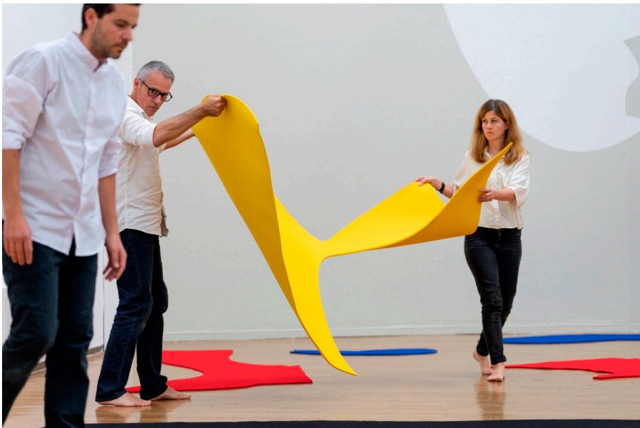
Figure 7. Cesare Viel. Infinita ricomposizione , performance, 2019, PAC Milano, photo Lorenzo Palmieri. Used with permission.

In a lecture he held at the University of Genoa in Spring 2019, Cesare Viel declared his intent to get to a minimal degree in his actions in opposition not only to the request from the contemporary society for activeness and achievement, but also to what we could call the “performant side of the performance”, to the so-called “endurance performance” 27 . The latter celebrates the pure, and at times spectacular, endurance of the artist’s body. Viel indeed intends to work on the opposite aspect of boredom, “namely the first level of the unfamiliar: once boredom passes, a strong, non-utilitarian attention is activated towards an experiential journey which stands at the center of the performance” 28 . The spectator is thereby encouraged not to be surprised and astounded by what he observes, but rather to concentrate and increase his own emotional and intellectual alertness.