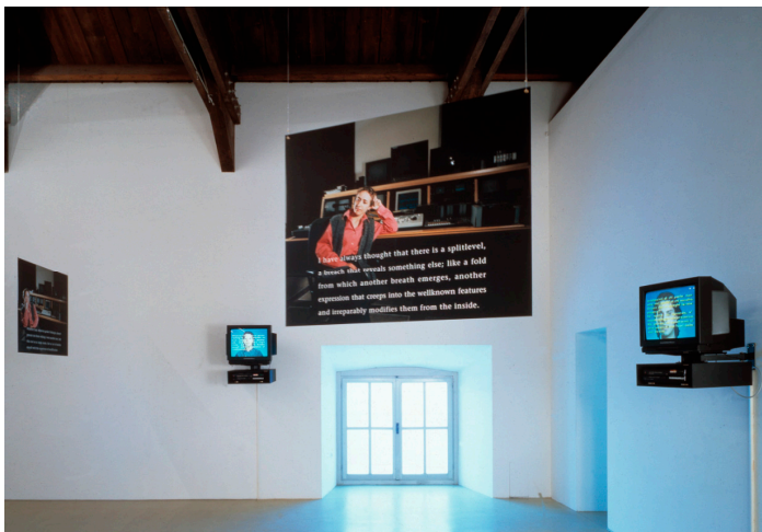
Figure 2. Cesare Viel, Androginia , 1994, installation, two monitors, two videos, two color photographic panels on aluminum, 110 × 120 cm each, Museo d'Arte Contemporanea, Castello di Rivoli, photo Roberto Marossi. Used with permission.