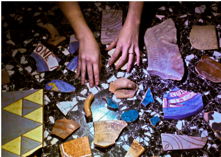
Figure 5. Cesare Viel, Verso Jorn , 2016, performance, Casa Museo Jorn, Albisola Marina, photo Cocis Ferrari. Used with permission.

I wanted to make a map of this whole process, but its borders are not clear to me, they get lost more and more; they unravel; they drift. It is impossible, I realize, to make a rational map, complete with these strange movements, groping around in the dark. Honestly, I cannot make this map in this room, because of all the overlapping levels: a complete and contradictory stratification of all the emotions. 24 (Viel 2016, 00:11.45)