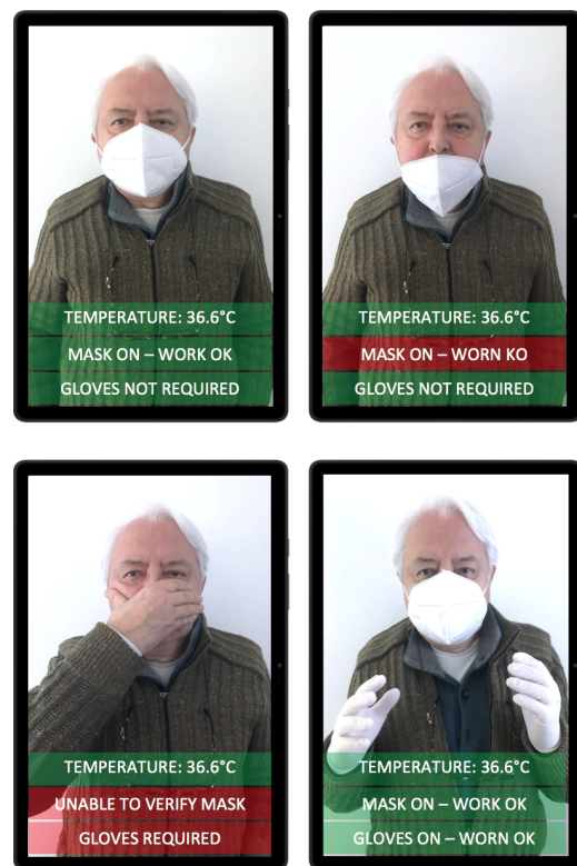
Fig. 1. Mask and gloves control, color code

Figures 1 and figure 2 illustrate the characteristics of the thermoscanner and how it works in combination with the turnstile, while figure 3 highlights the anti Covid access path devised by the team, a particularly suitable path for blocking people coming from suspicious places and confining them before can spread the virus.