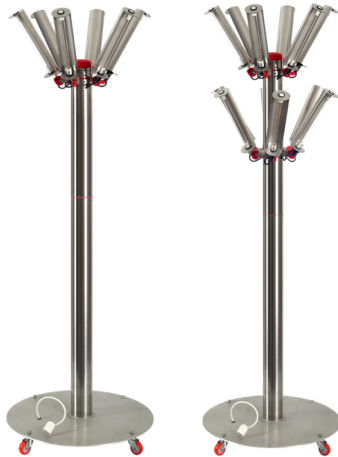
Fig. 3. UV-C and Ozone Sanitization machines

The 4.0 machine performs the sanitization by creating gaseous Ozone, which will be dismantled by the same machine at the end of the treatment, by retracing the phases found in Nature, in the Ozonosphere, described by the Chapman Cycle, thus guaranteeing the deactivation of any microorganism or pathogen such as viruses, bacteria, molds, fungi, spores (and even the elimination of insects) without using harmful chemicals and, also, at low cost (negligible consumption of energy).