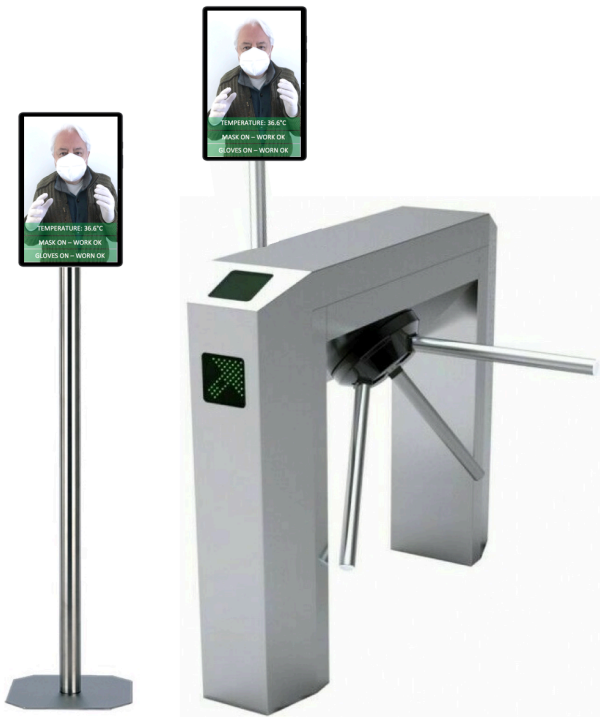
Fig. 2. Thermoscanner controls on User interface